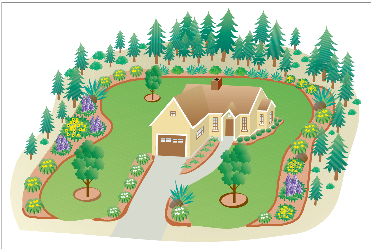
Figure 1.—A fuel break that includes fire-resistant plants can help protect your home by reducing and blocking intense heat.

When landscaping around a home, most homeowners are interested in creating a landscape that is aesthetically pleasing, complements their home, and has variations in color, texture, flowers, and foliage. When selecting plants, you also should consider the flammability of plants