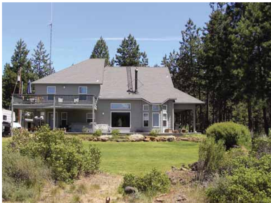
Figure 4.—A well-maintained lawn can be included in a fire-resistant landscape and serves as an effective fuel break.