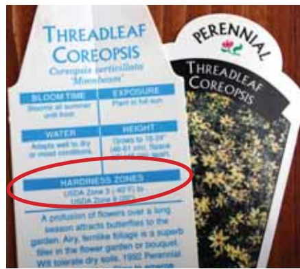
Figure 6.—Example of a plant tag, which includes hardiness zone along with other plant characteristics.

There are 11 designated zones, with zone 1 being the coldest (requiring the most cold-hardy plants) and zone 11 being the warmest (suitable for plants not