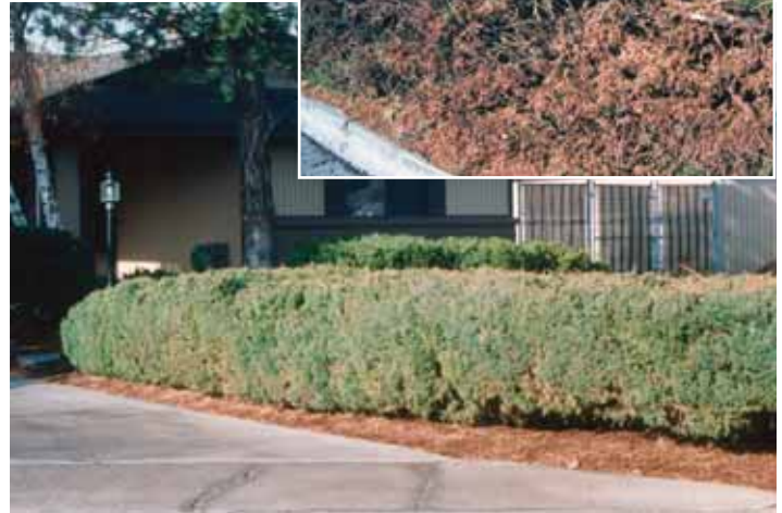
Figure 2.—Juniper is one example of a highly flammable plant, due to the accumulation of old, dead needles within the plant (see inset photo) and volatile oils in the foliage.