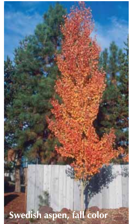
Swedish aspen, fall color