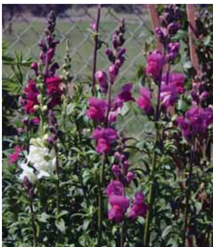
Figure 3.—Annuals can be part of a fire-resistant landscape if well watered and well maintained.

Annuals (see Figure 3) can be part of a fire-resistant landscape if well watered and well maintained. We have not listed each of these due to the large number of annuals available to the homeowner.