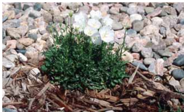
Figure 5.—A combination of wood bark mulch surrounded by decorative rock is less flammable than wood bark mulch alone, and it will not scorch plants.

you landscape with bark mulch up against your home, make sure it remains moist to prevent ignition. You may also consider using less flammable types of mulch, such as gravel or decorative rock, or a combination of wood bark mulch and decorative rock (see Figure 5).